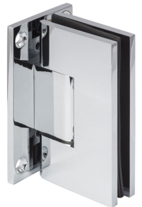
Square Shower Glass Hinge