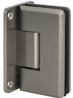
Beveled Shower Glass Hinge